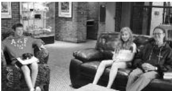
(BELOW): ENJOYING OUR NEW ADMINISTRATIVE FOYER FURNISHINGS