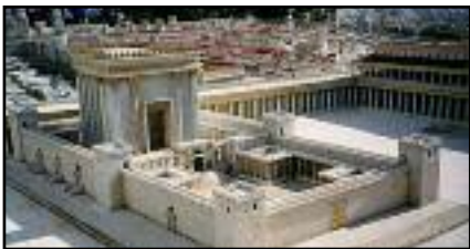
The Second Temple in Jerusalem

This should lead into a discussion of how when people don't work together they can often destroy the things they love through sinat chinam , senseless hatred (like knocking down your brother's tower for no reason). I hope that after you've talked about this, you and your child will sit down to build the biggest and most beautiful "Temple" that you can. I would love to hear about the conversations you have with your children or grandchildren – mser@adatshalom.org .