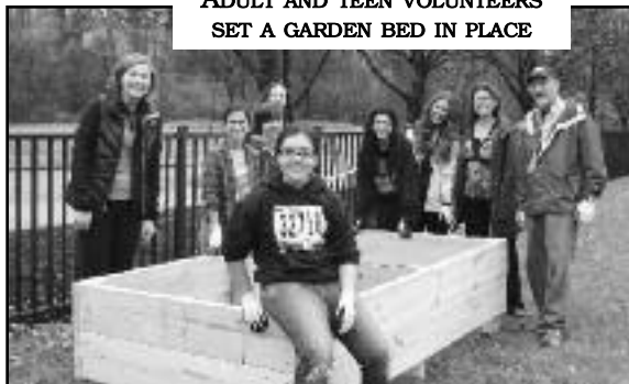
ADULT AND TEEN VOLUNTEERS SET A GARDEN BED IN PLACE

During the week of January 12, our students will be planting seedlings, creating Hebrew garden markers, and learning about Tu B'Shevat in many hands-on and sensory ways.