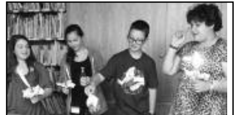
RIGHT: TEEN HELPERS