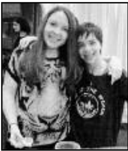
at our Family Latke Party