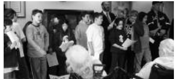
Religious School Students Sing Along with our Men's Club To Bring Chanukah Joy to Area Seniors