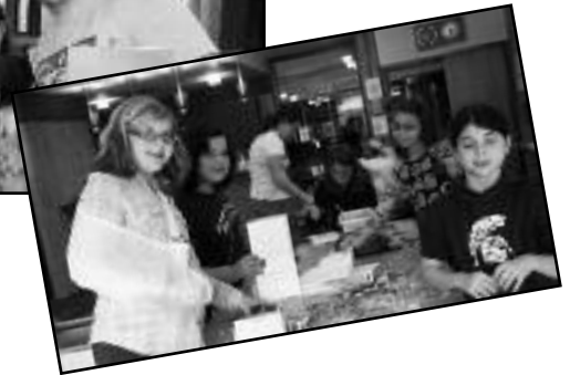
Right: Gesher Youth Group 6-7th Grade Tikkun Olam Event