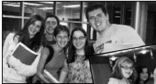
Adat Shalom Teens at ATID