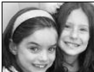
Learning about animals with the 1st-3rd Grade Makor Youth Group