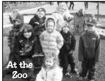
At the Zoo

The Kindergarten Class spent an amazing day at the Detroit Zoo this fall. During the month of October, the children began an animal unit, gan chayot . In both their English and Hebrew Immersion classes they studied the different types of animals as well as their habitats.