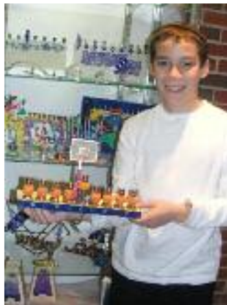
Waiting for you at the Sisterhood Gift Shop - a unique Chanukiah for every member of your family!