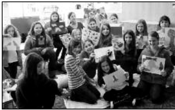
OUR BUSY YOUTH – (L) MAKOR-SHORESH PROJECT, (C) TEEN VOLUNTEERS HAD A BLAST PAINTING A NEW COMPUTER ROOM AT THE BALDWIN CENTER, (R) IT'S A GIRL THING!