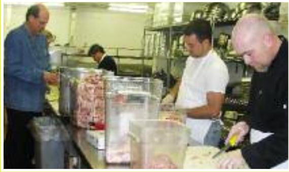
ECC class visits the kitchen