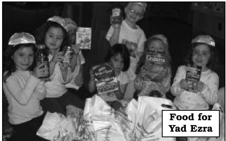
Food for Yad Ezra